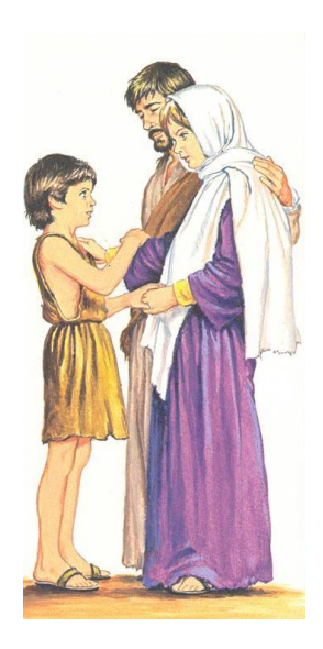
Figure 4. Ife, Elaine. 1982. The Childhood of Jesus . Nashville: Thomas Nelson Publishers. Illustration by Eric Rowe.