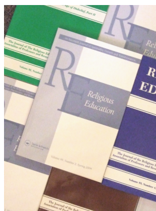
Religious Education the journal of the REA

Articles consider education in houses of worship, schools, informal programs, and institutions of higher learning involving adults, youth, children, and families. Topics addressed include educational theory, theology, and education; tradition and trends; policy and practice; models and methods; moral values and character education; sacred texts; and spiritual, cultural and social issues in education.